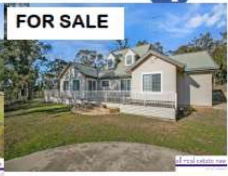
79 Fernloff Rd WAMBOIN

I have been selling properties in the area for many years now and my clients are very happy with the prices I have achieved. We also do free pre-sale inspections and can suggest ideas & options to improve the marketing of your property. We do all we can to obtain the absolute best result for you in the timeline that suits you. So please don't be talked into selling for less as it is not fair to yourselves or your family and it affects all the future valuations for the area. We work 7 days a week and can come at anytime that suits your schedule. So please, contact us come out and do a genuine appraisal on your property