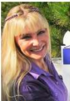
Licence No: 20059367

We often sell properties before they are advertised, as we have a huge client data base with many clients after properties of a certain type and price range waiting for the right one. Which could be yours! So please call us, I have a great team that work with me, for you.