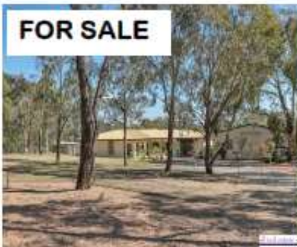
8 Proud Pl WAMBOIN