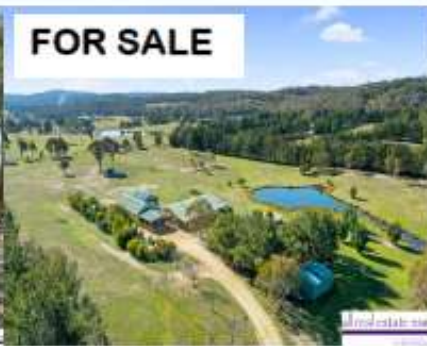
1240 Norton Rd WAMBOIN